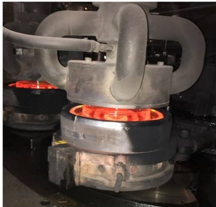
Automated Shell Forming Process