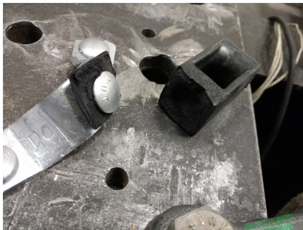
Sample after Cantilever Test