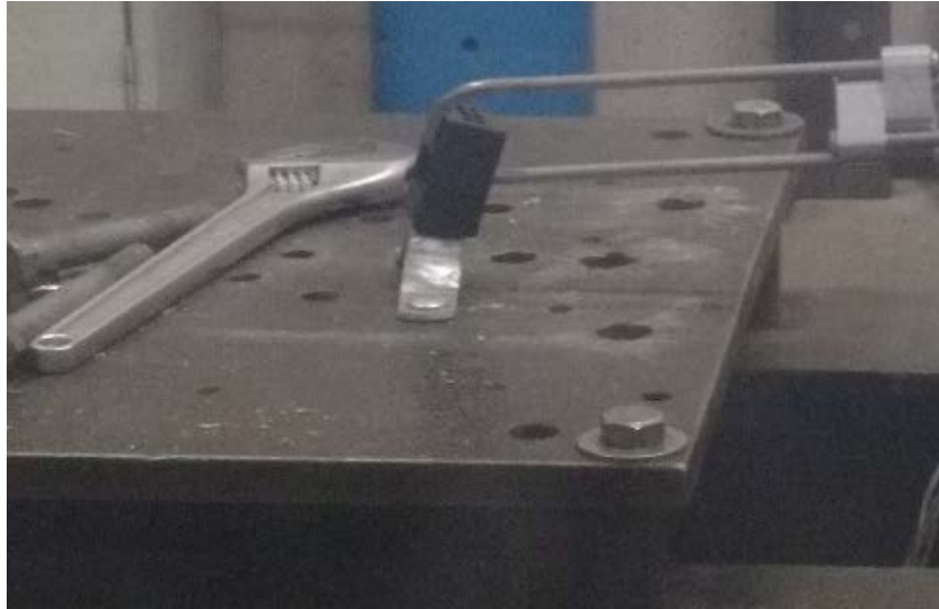
Figure 2: Cantilever Test Setup