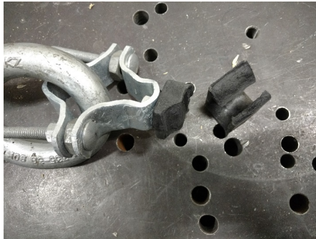
Sample after Tensile Test