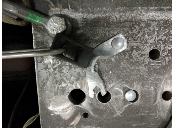
Sample after Cantilever Test