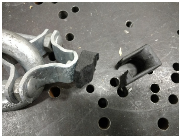
Samples after Tensile Test