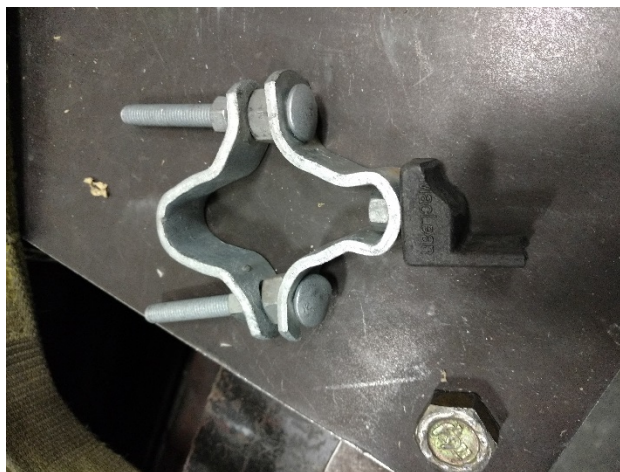
Samples after Tensile Test