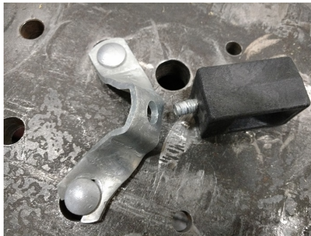
Sample after Cantilever Test