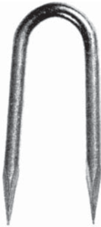
Rolled (Diamond) Point