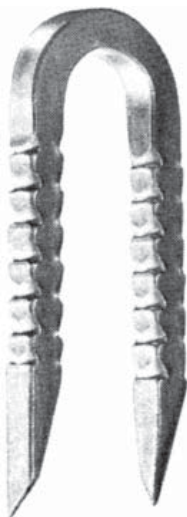
Square Shank Barbed